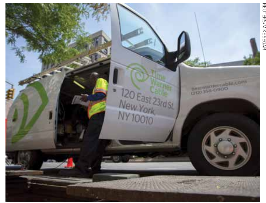
Time Warner Cable is in line to be the next big cable brand to fall by the wayside in the wake of cable consolidation.

At the same time, satellite subscriber growth has stalled — DirecTV lost 133,000 net subscribers in the second quarter, well below the 60,000 additions in the first three months of the year. No. 2 satellite company Dish Network lost 81,000 net subscribers in the second quarter, almost twice the 44,000 it lost during the previous year.